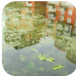
Printed: June 2010 Leaflet written and designed by Chris Blandford Associates www.cba.uk.net